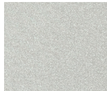
Stark Radiance BO Platinum