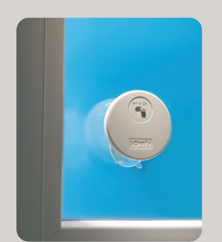
Mounts directly to window glass