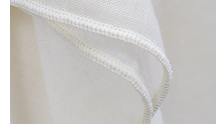
Euro Hem (Sheer Only)