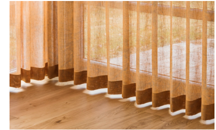
4" Bottom Hem (Sheer and Lined)

If customers provides their own tracks for ripplefold workroom needs to have carrier count for the drapery to mach.