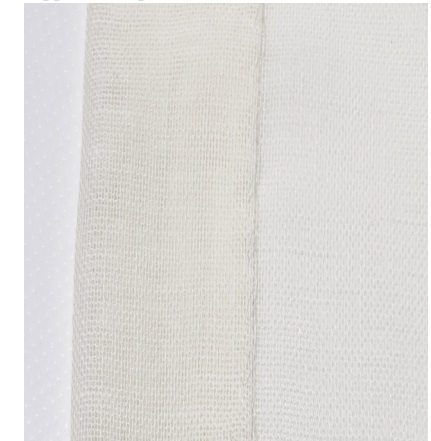
Blind Stitched Side Hem

Ripplefold is an ultra-contemporary style of traversing drapery panels with a distinctive S-curve ripple effect. The ripples are created by the chosen carriers corded together to create that consistent wave varying from 60%, 80%, 100% and 120% fullness.